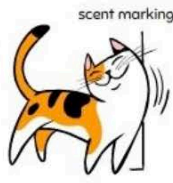
"THIS IS MINE"